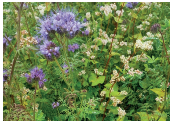
The most impressive performer was Brassica Break, says Francis Dunne, with this balanced blend out-yielding the average of its components, suppressing weeds well and flowering over a long period

“However, the most impressive performer was Brassica Break. A balanced blend of Buckwheat, Phacelia, Crimson clover and Berseem clover, with each species rooting into a different level of the soil profile, it out-yielded the average of its components. Response to N was minimal – indeed, root development was better without N. But it suppressed weeds well and flowered