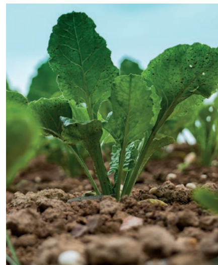
Nemguard is a worthy replacement for Vydate in sugar beet

Soil sampling is also useful in terms of beet cyst nematode (BCN) control, with the key for growers with a known or suspected BCN burden being the selection of a tolerant variety: this won't eliminate the issue, but it will help to mitigate the potential for damage to be incurred. Rotation also has a role to play in reducing BCN loadings, with care also needed to reduce survival rates from one crop to the next by eliminating green bridges.