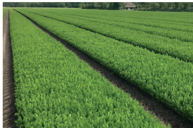
Velum Prime & Nemguard are good options in carrots

Although Vydate is no longer available in sugar beet, Nemguard is a more than worthy replacement and is proven to successfully reduce docking disorder and root fanging caused by free-living nematodes (FLN). The BBRO recommends an application rate of 10kg/ha for Nemguard which is higher than the outgoing Vydate rate, so granular applicators will need to be re-calibrated accordingly. Soil sampling for FLN is also recommended, with Trichodorus populations greater than 1000/litre of soil or Longidorus