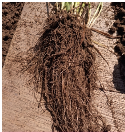
Two ryegrass-based options in the trial – Hurricane Pro-Nitro and Clamp-Saver (pictured) – created the greatest below-ground biomass and the best regrowth after cutting

For more information on the trials or cover crops, contact your ProCam or Field Options agronomist.