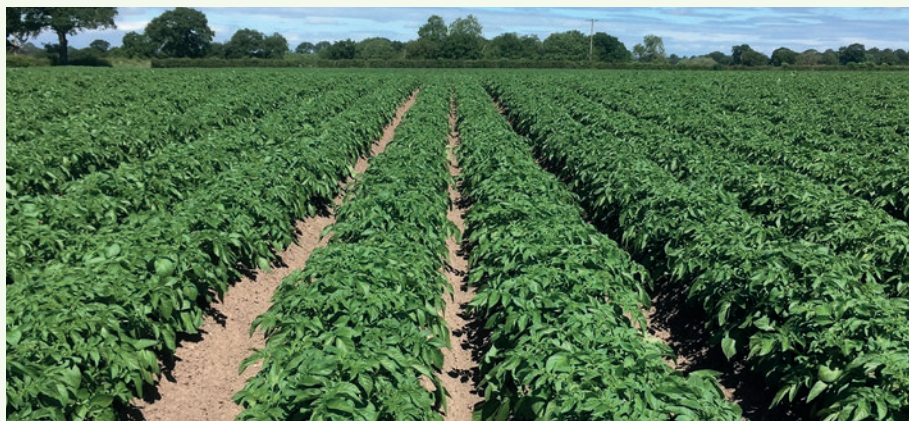
Velum Prime & Nemathorin give good PCN control